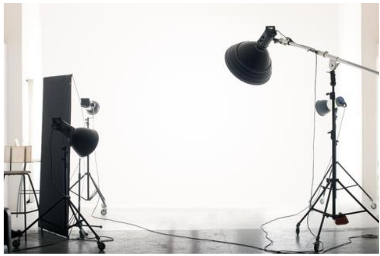
In order to create the kind of diffused-lighting effect that's going to be the most flattering you're going to want to use a technique called triangle lighting.

Imagine you have a square room. You're going to put one light in the bottom right hand corner, one slightly smaller light on the bottom left hand corner, and one even smaller light in the top right hand corner. You're going to adjust that light until it's soft on your face or your computer, rather than hard and sharp. Sometimes you'll have to bounce the light off of white walls just a little bit rather than aiming it directly at your face in order to achieve this effect. Get someone to help you set up your lights until you have the hang of it, as they'll be able to tell you whether the lighting is too harsh or not. If you can't get someone to help you just go ahead and take a couple of sample shots with your video camera to see if you've gotten the light correct yet. Once you do, start recording your video in earnest.