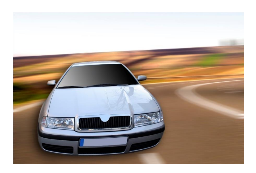
Chapter 4: Getting Traffic to your List

Now that you know how to make the most of your e-mail list it's time to talk about how to get subscribers at all. I'm going to share a number of traffic generation methods and techniques that have benefitted me.